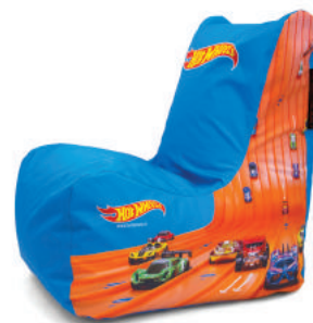
Printed bean bags projects