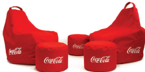
Embroidered bean bags projects